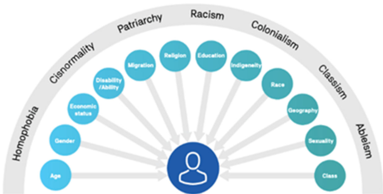
Figure 1. Representation of intersectionality from the perspective of individual characteristics and societal power structures.

Figure 1. Representation of Intersectionality.